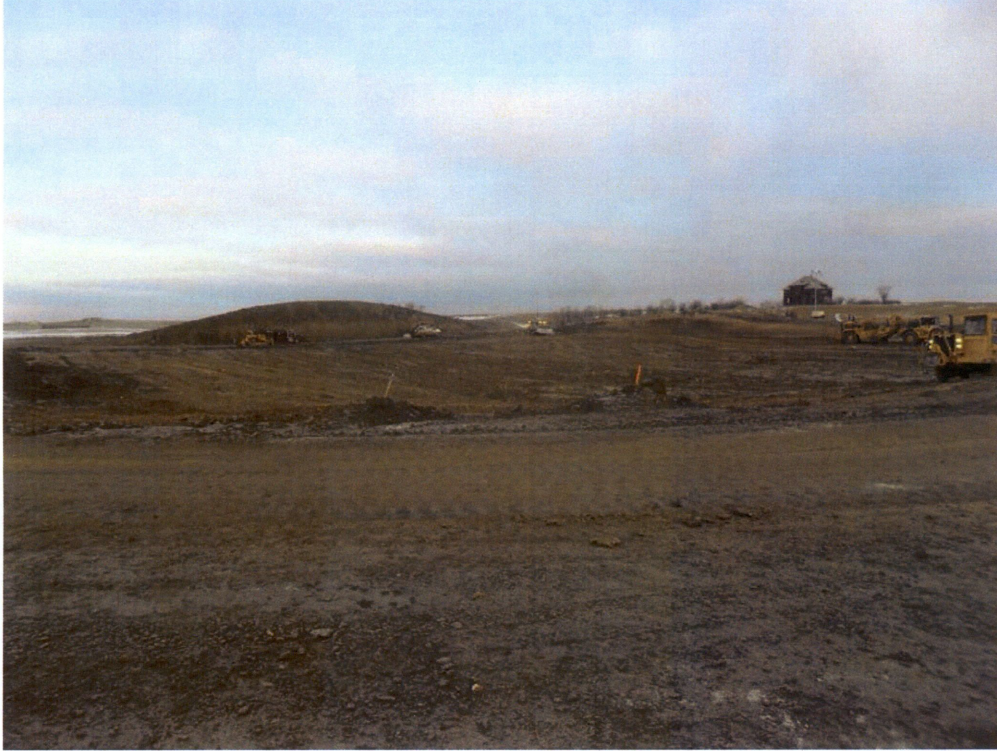
Report Photo #2 “Topsoil pile left. Subsoil pile right” at GPS Coordinates: 48.285556°N 103.322778°W